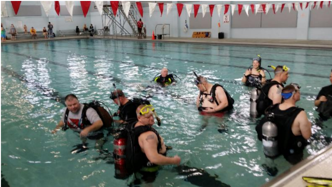
Scuba Warrior Class

6) And finally the most exciting news because of a recent grant from Infinite Hero in California we will hopefully in the near future be taking the "Scuba Warriors Program" to wounded Marines and Sailors in San Diego area; we are working on that now. Stay tuned!