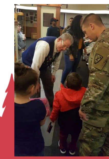
This young man wanted a warm coat like his sister has. But he wanted red not pink. Dad, an MP, watches on. Again, one of the Lady MP's is helping get the size correct.