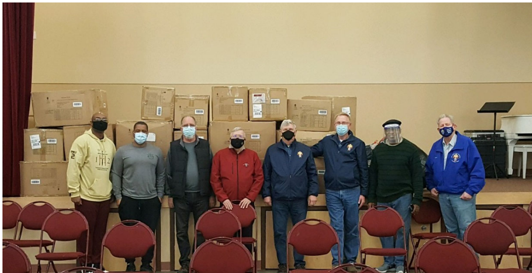
Pictured left: Knights and Chaplains with 277 coats for Four Chaplains Association.

🌿 St John Mary Vianney 11408 -Kirkland 🌿 St Teresa of Calcutta 14046 -Woodinville 🌿 Holy Family Parish -Kirkland 🌿 St Jude Parish -Redmond 🌿 Federal Way Knights of Columbus