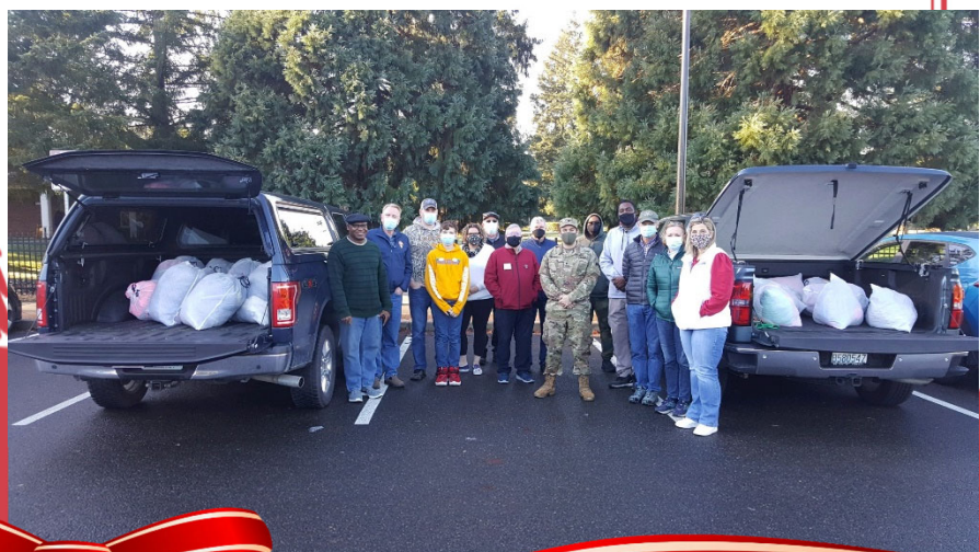
Pictured right: 190 coats and volunteers for Rangers, 160th SOAR and 1SF